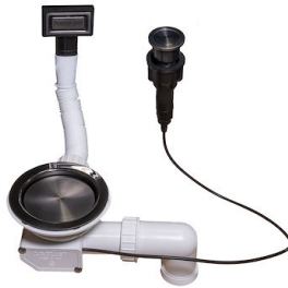
Space Push Gun Metal automatic waste fitting - PO 8407 120