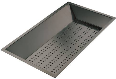
Stainless steel perforated tray PVD Gun Metal 8151 006