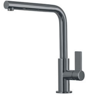
Mixer Tap Omega Gun Metal 8497 856